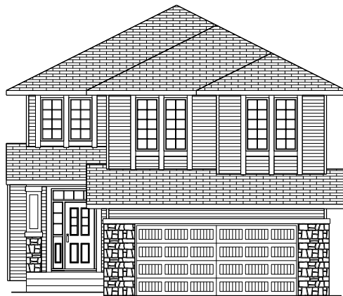
B - FOURSQUARE - 2629 SQ.FT.