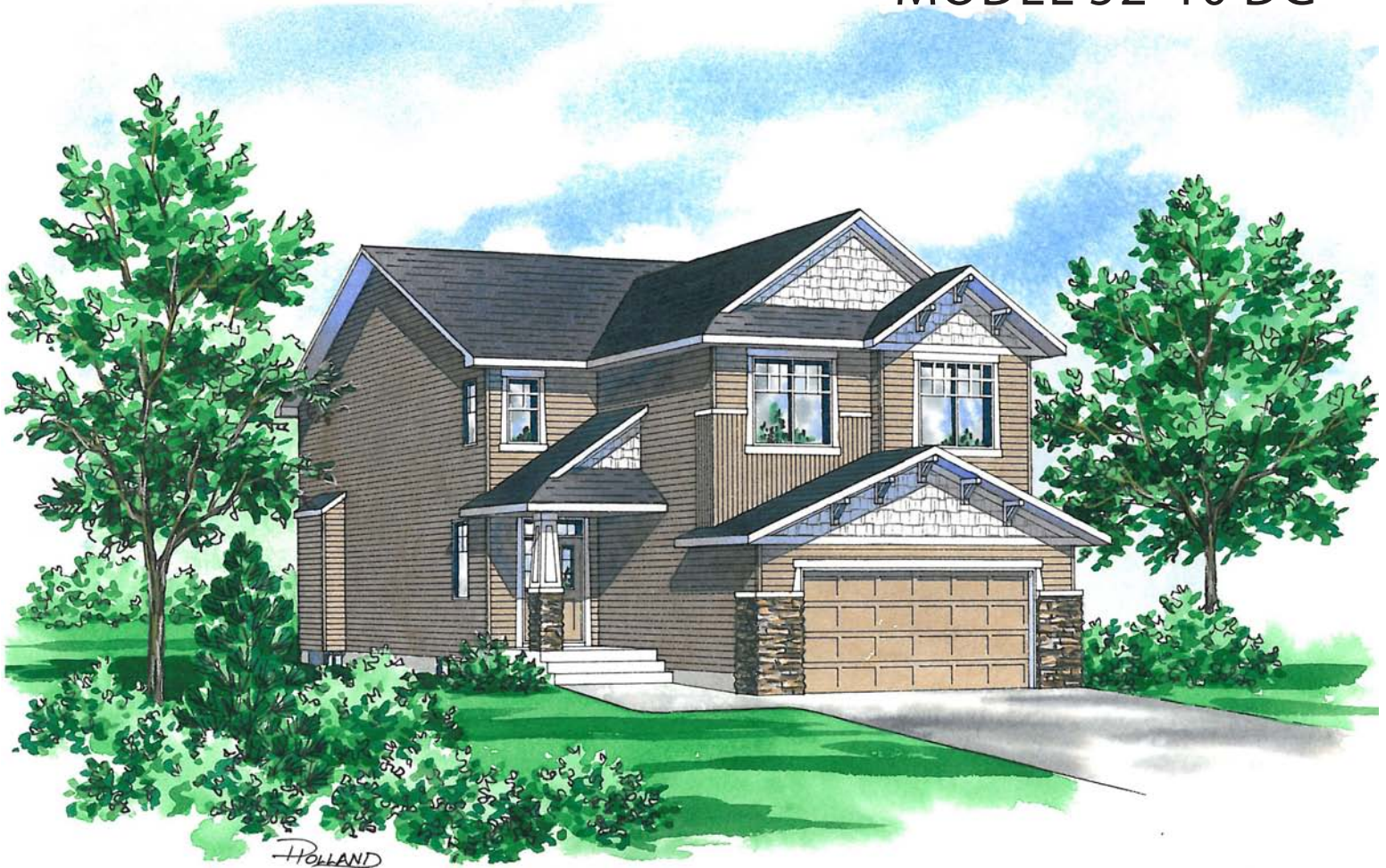
A - CRAFTSMAN - 2629 SQ.FT.