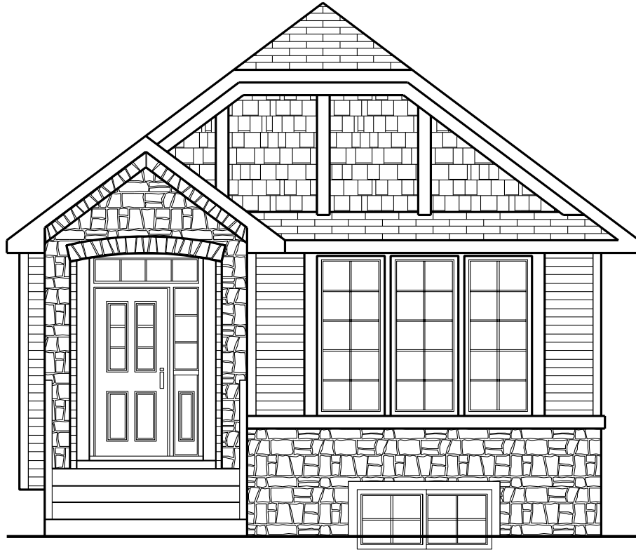
A - ENGLISH COTTAGE - 1263 SQ.FT.