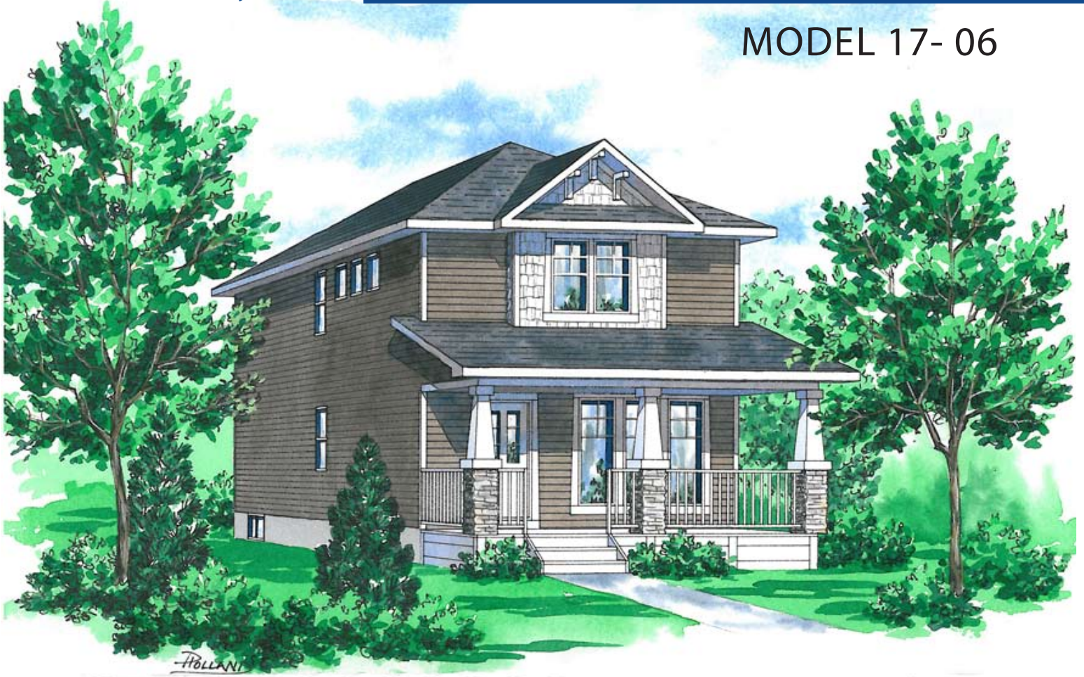
A - CRAFTSMAN - 1509 SQ.FT.