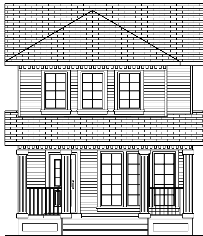
B - COLONIAL - 1517 SQ.FT.