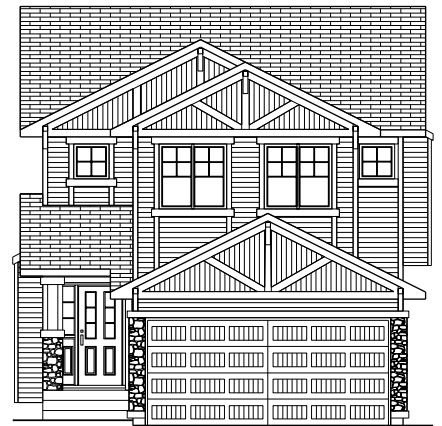
F - ALPINE - 1676 SQ.FT.