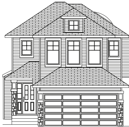
E - FOURSQUARE - 1676 SQ.FT.