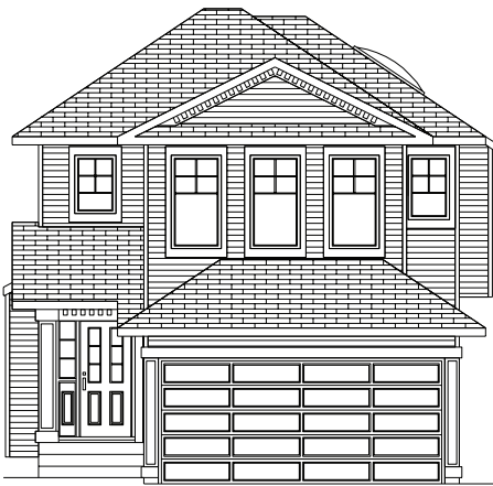
C - COLONIAL - 1676 SQ.FT.