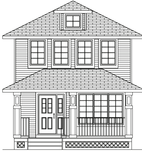
A - FOURSQUARE