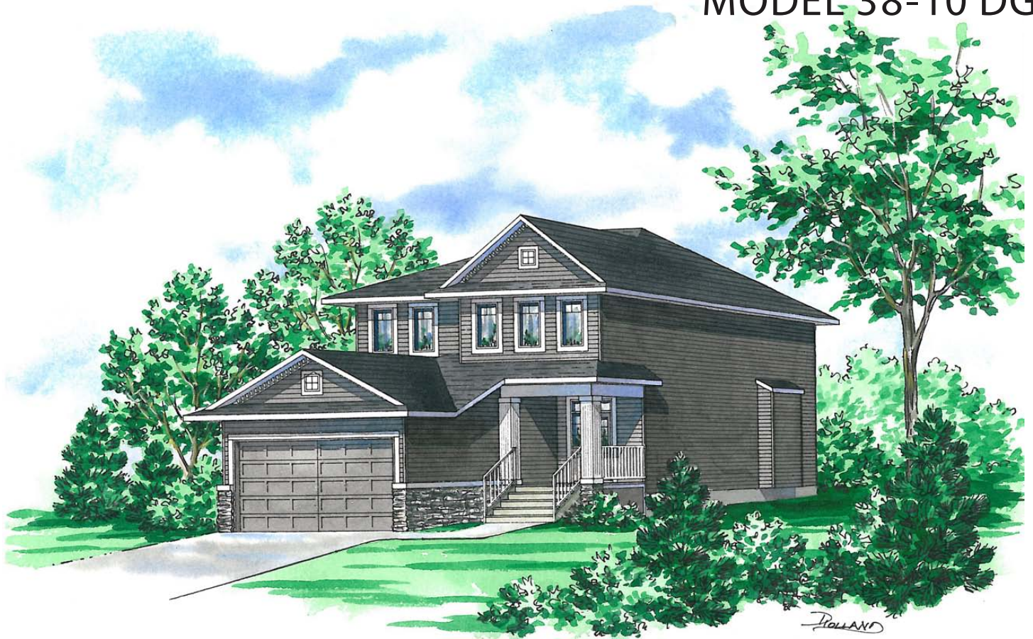
E - COLONIAL - 1986 SQ.FT.