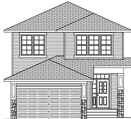
F - FOURSQUARE - 1986 SQ.FT.