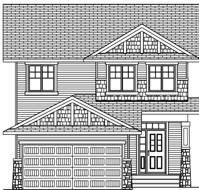
D - CRAFTSMAN - 1986 SQ.FT.